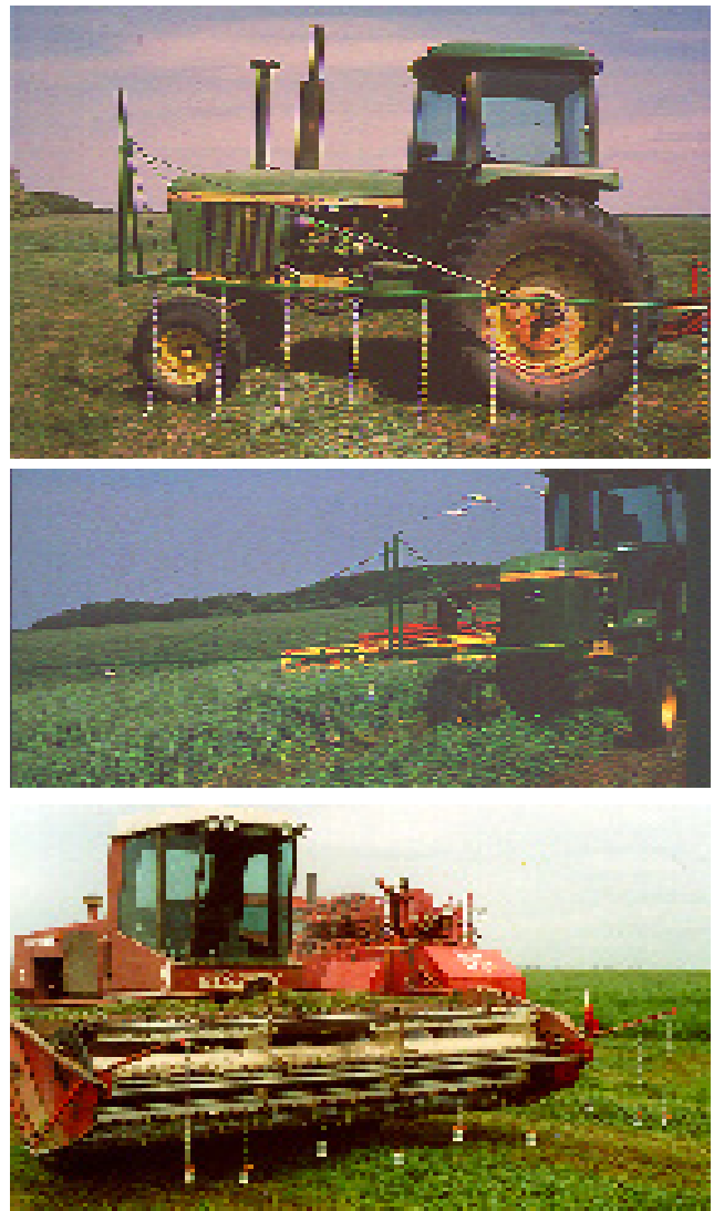
Figure 2. Tractor-pulled and self-propelled haybines mounted with flushing bar devices.

The flushing device is a simple triangular frame of square steel tubing (see figure 3). The frame is 12 feet in length. A 4 ft. long, removable end section is adjustable to suit different mower widths. Three, foot-long galvanized chains at 20 in. intervals (others have used 6.5 in. - 10 inch intervals) are hung vertically to penetrate vegetation. The lower 6 in.